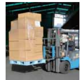
Cargo delivered to storage areas is safely and quickly sorted by forklift by expert staff.