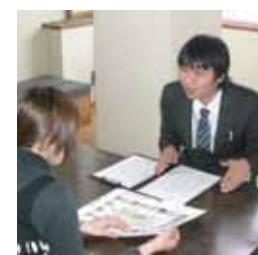
Whether for business or individual needs, our sales staff will visit you directly and provide an estimate