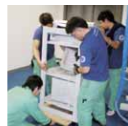
OA equipment moving is thoroughly and safely carried out by moving professionals