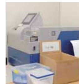
The explosive detection equipment is installed in the office and we provide thorough security for export cargo.