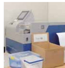
The explosive detection equipment is installed in the office and we provide thorough security for export cargo.