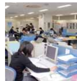
Our staff fight to use every moment to its utmost potential at the Narita Logistics Center.