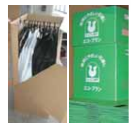
We prepare a variety of packing materials, and can meet a wide variety and number of moving needs