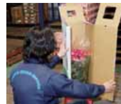
Cut flowers from overseas are carefully packed into individual boxes

Although obvious for our country, which depends on imports for the majority of its food, Narita Airport receives huge volume shipments of fresh seafood, vegetable, fruits and other foodstuffs from countries around the world, every single day. The unbelievably large hauls of seafood that pass through have led to Narita Airport sometimes being called "Narita Fishing Port". However, for foodstuffs freshness is key. Fresh products must be shipped to every region of the