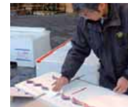
Tuna inspections are carried out every day at the perishable cargo facilities