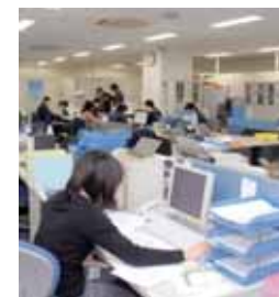
Our staff fight to use every moment to its utmost potential at the Narita Logistics Center.

Detailed and precise handling which will not damage cargo is the basis for all of our dry cargo handling work as well.