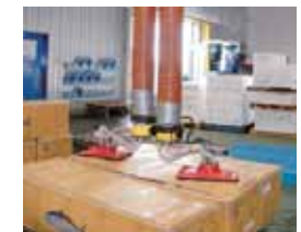
Use of vacuum lifts allows for safe and speedy transfer of even heavy cargo